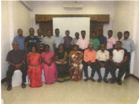
Local volunteers with global committee members

Exam preparation and revisions classes are conducted at Grade 5 level for the scholarship examination and for GCE O/L to assist children in Vanni area schools where shortage of teachers for vital subjects has been a chronic issue. A group of volunteer teachers from Jaffna go to Vanni consecutively for 11 weekends to instruct Grade 5 and 24 weekends for GCE O/L students. They provide coaching from the past examination point of view. Tamil Aid, UK and Unifund, Australia generously sponsor these weekend classes.